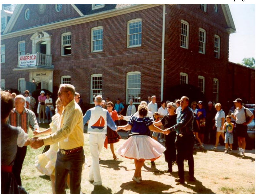
RI State Day at The Big E