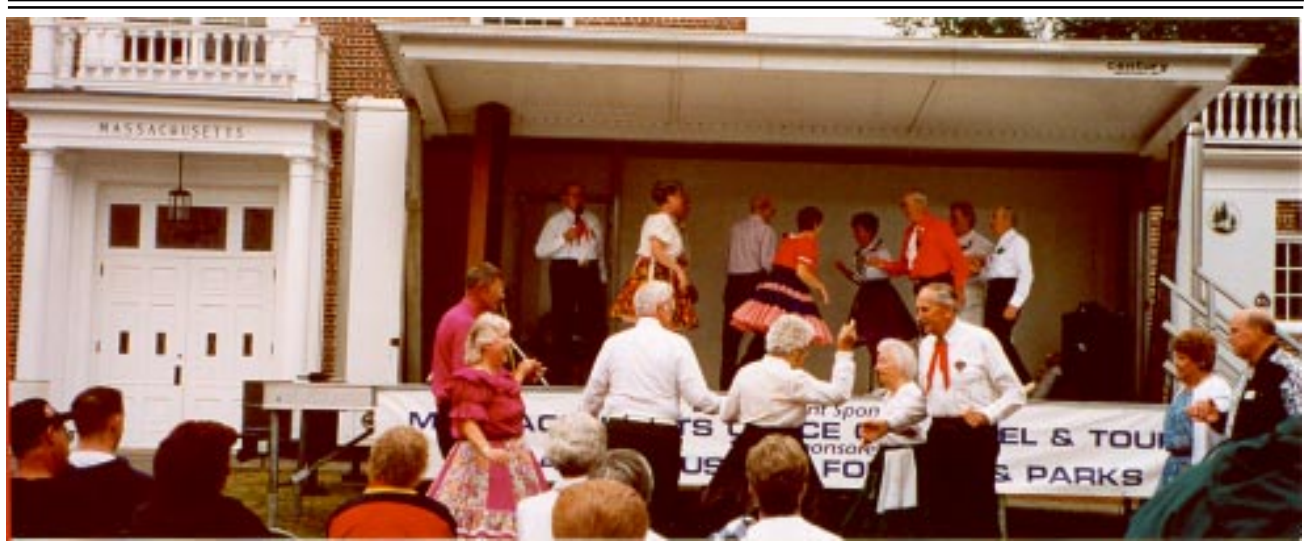
MA State Day at The Big E