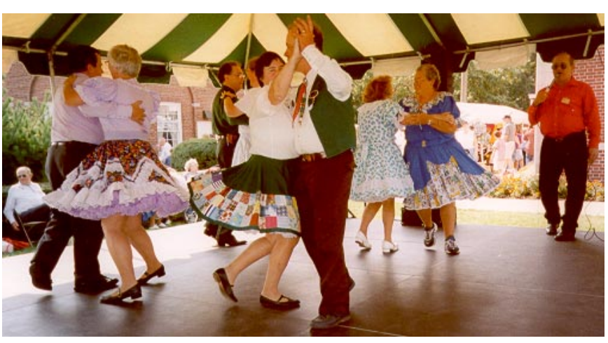
VT State Day at The Big E