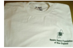
#102 - SDFNE logo Tee = $10