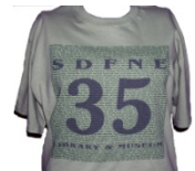
#103 - 35 th Anniversary Tee = One Tee = $20 Two for $35