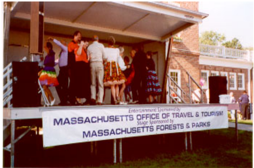
INTERACTIVE SQUARE DANCING AT THE BIG E, WEST SPRINGFIELD, MA - SEPTEMBER 2002: A FUN TIME FOR ALL!