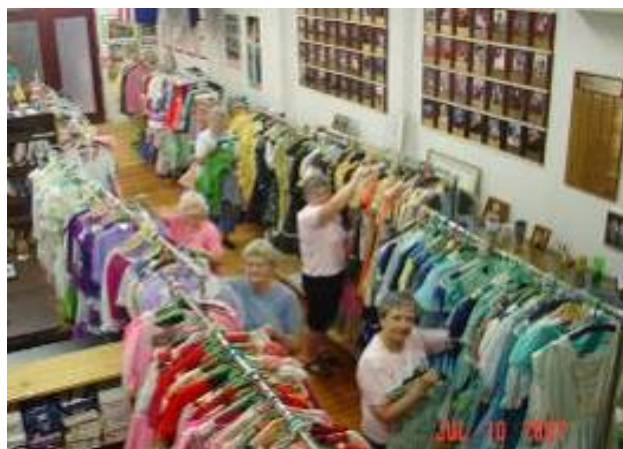
Volunteers with racks and racks of vintage clothing.