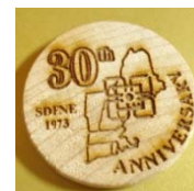
#110 - Wooden Magnet = $2