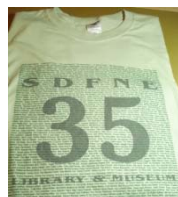
#103 - 35 th Anniversary Tee = One Tee = $20 Two for $35