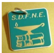
#107 - Dangle = $2