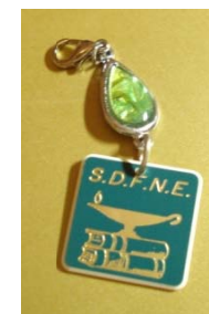
#112 - Zipper Pull = $2