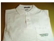
#104 - Collared Polo Shirt/ short sleeves - SDFNE w/ address = $15.