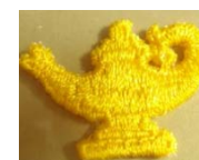
#113 - Embroidered Yellow "Wisdom Lamp" (stick ons) = 2 for $1

The SDFNE's Charlie & Bertha Baldwin Museum offers a variety of great items, including tees, planners, cook books, dangles, pens, and not all are pictured here. Your purchase supports the preservation of Square Dance History. Please place your order by filling out the Order form. Thank you: