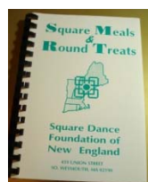
#106 - Cookbook: Square Meals & Round Treats = $8.