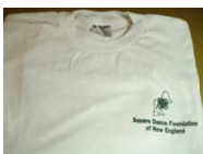
#102 - SDFNE logo Tee = $10