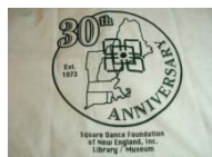
#105 - Collared Polo Shirt/ short sleeves - 30 th Commemorative = $15.