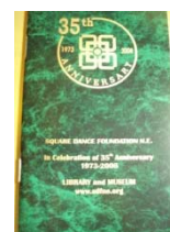
#109 - Day Planner $4