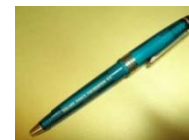
#111 - SDFNE Pen = $2