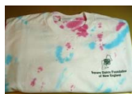
#101 - Tie-Dye Tee = $10