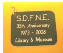
#108 - Dangle = $2